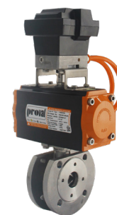
V Port Valve with pneumatic actuator